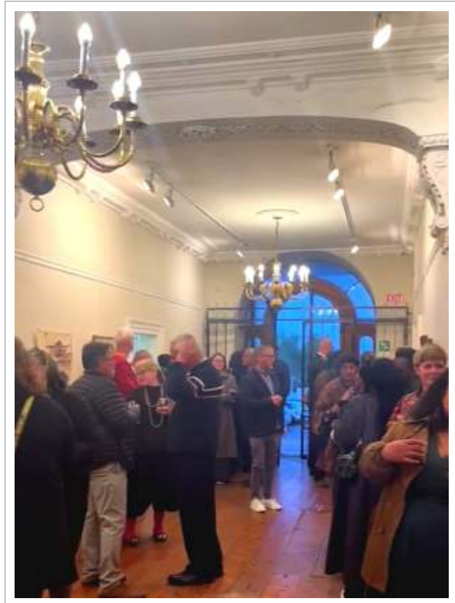
The magnificent entrance lobby of Ruth Prowse School of Art, where the speeches took place