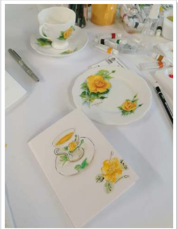
We got the opportunity to paint/draw some of those lovely teacups, saucers, little pots and several plants, we also painted strawberries, which we were allowed to eat later.